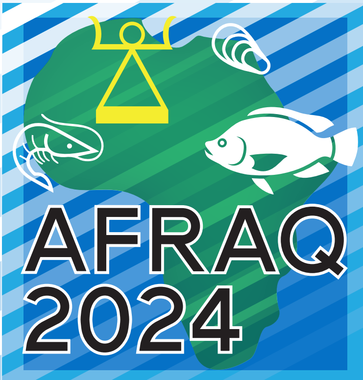
EXHIBIT INVITE NOVEMBER 20-23 HAMMAMET TUNESIA

AQUACULTURE AFRICA 2024 Hammamet Tunisia, Nov 20-23