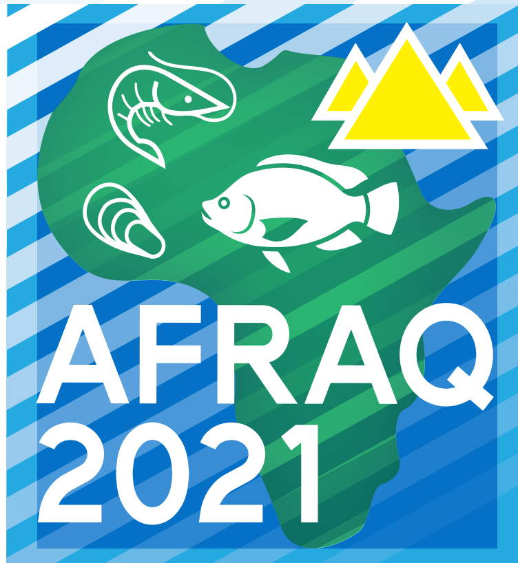
EXHIBIT INVITE MARCH 25 - 28, 2022 EGYPT - ALEXANDRIA

AQUACULTURE AFRICA 2021 Alexandria Egypt - March 25-28, 2022